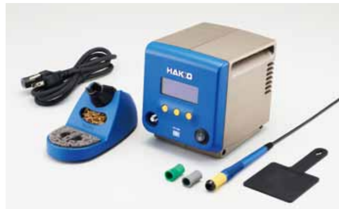
Station, Handpiece (FX-1001), Heat resistant pad, Power cord, Sleeve (green), Sleeve (gray), Iron holder, Instruction manual